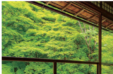
bizhub C227i model