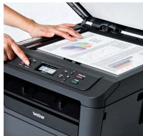
Scan colour documents direct to your PC

The DCP-7065DN comes complete with a range of easy-to-use software utilities to improve your productivity. Bundled with the powerful Scansoft® Paperport™ document management software, hard copy documents such as invoices can be scanned in colour, stored and managed electronically for future retrieval.