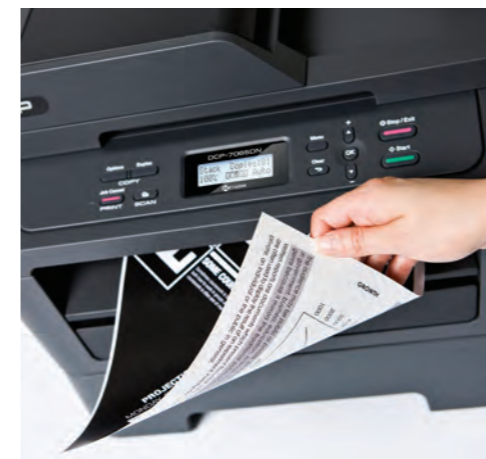
Automatic 2-sided printing to reduce print costs