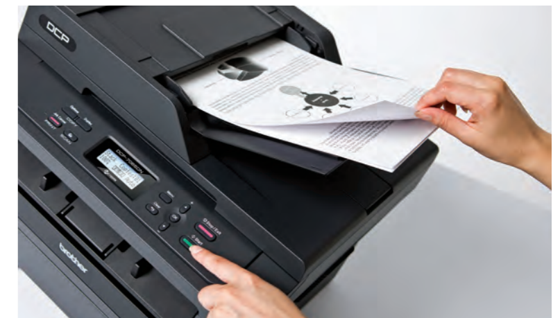
Scan, copy and fax multipage documents easily with the 35 sheet ADF